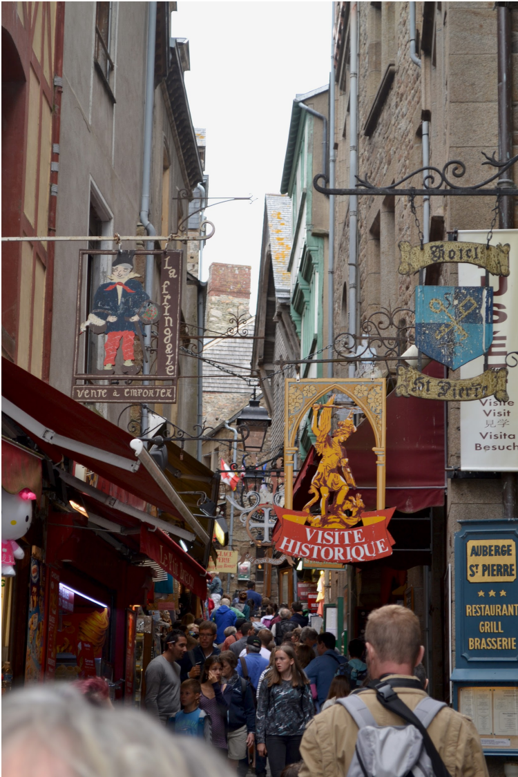
"Narrow Street" by Eloise Riche