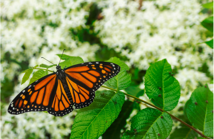
“The Monarchs Photo Collection” by Danielle Linton