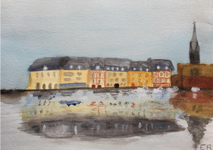
“Honfleur” by Eloise Riche