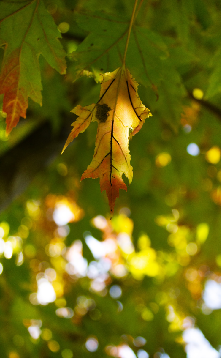
“Leaves of Missouri Photo Collection” by Danielle Linton