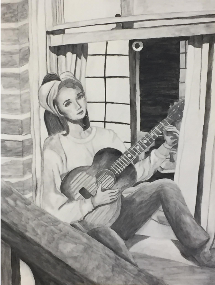
“Moon River” by Eloise Riche