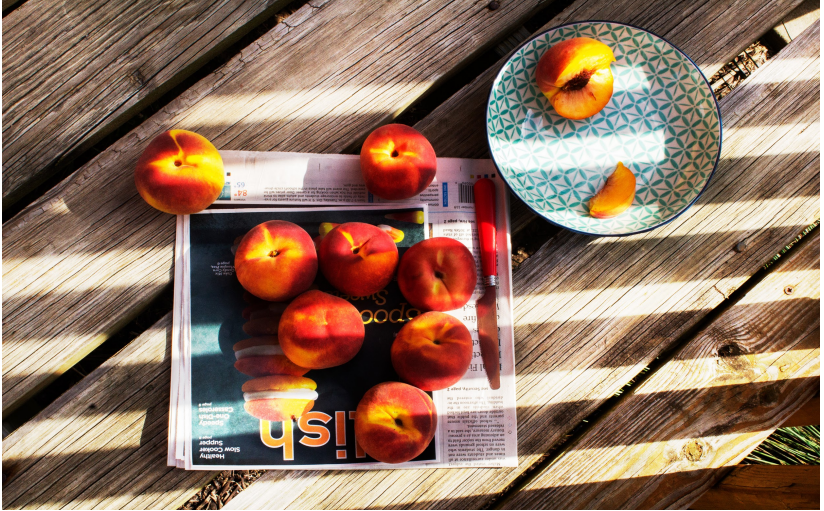
“Peaches and Meyerowitz Photo Collection” by Danielle Linton